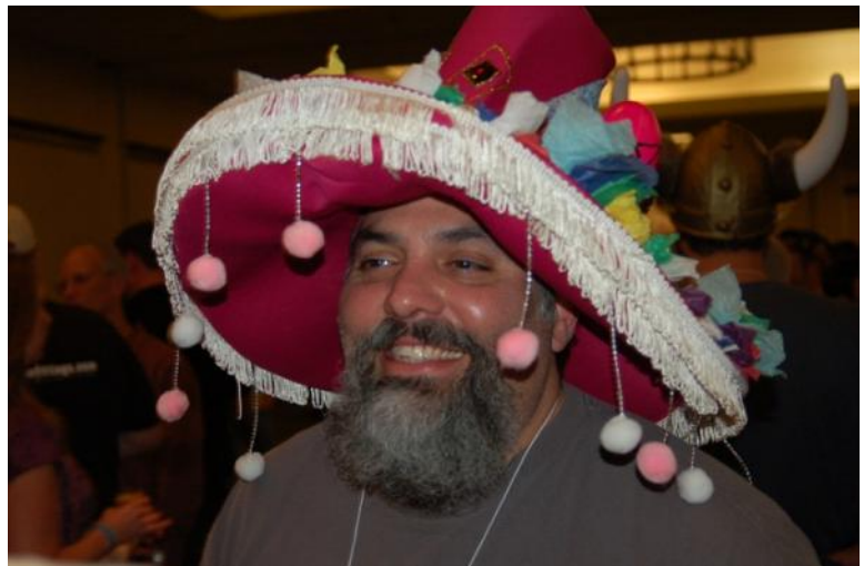
Orlando is style at the Bluebonnet.