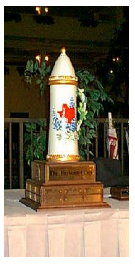
The Coveted Bluebonnet Trophy is now on display at Homebrew Headquarters