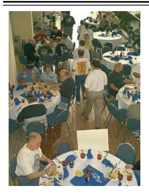
The Bluebonnet Judges enjoying their free lunch after the completion of second round judging, compliments of the 2001 Annual Bluebonnet Brew Off