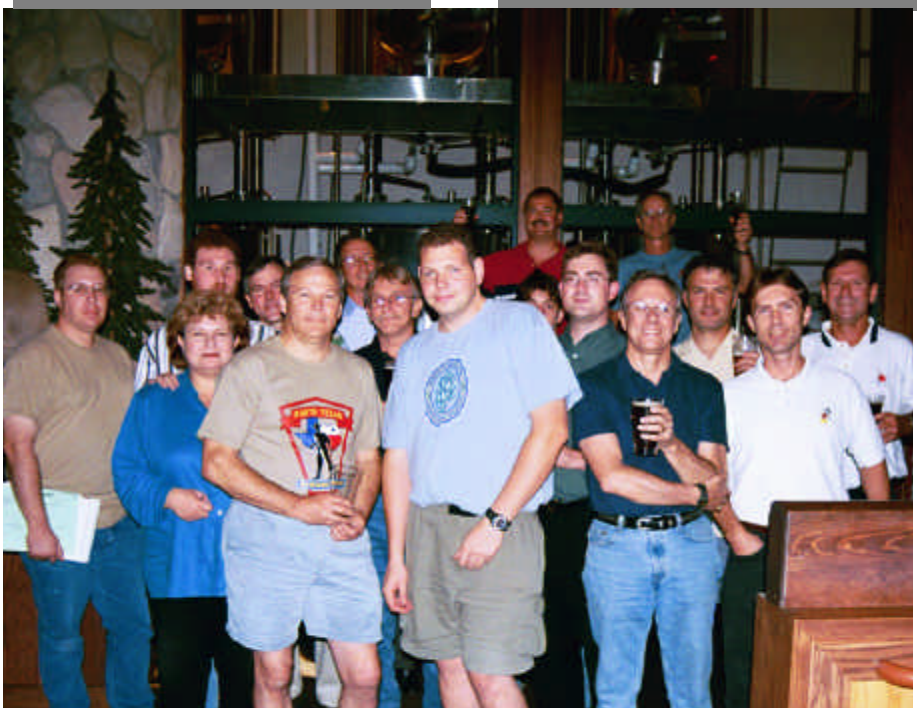
Happy Hour at Big Buck Brewery

looking, intelligent couple that know how to enjoy themselves. Boy I wish we could hang with them!" Happy brewing!