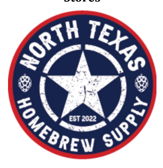
North Texas Homebrew Supply