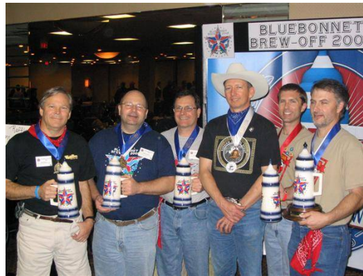
Bluebonnet 2005 winners

We'll have more information about login and Judging at this month's meeting.